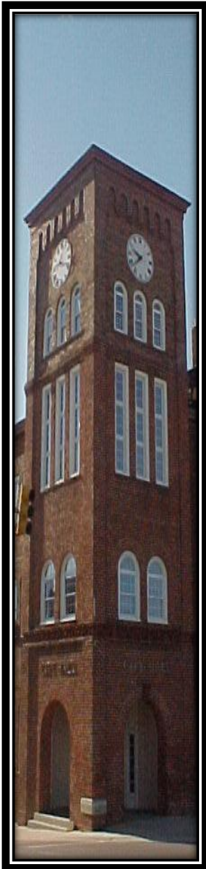
Chester City Hall (left) and Economic Development Administration Grant Funded Project (below)

Complete copies of the 2012 and 2013 audited financial statements with notes, disclosures, federal expenditures, and annual budget information for both the Council and its affiliated Development Corporation may be obtained from Catawba Regional, P.O. Box 450, Rock Hill, SC 29731.