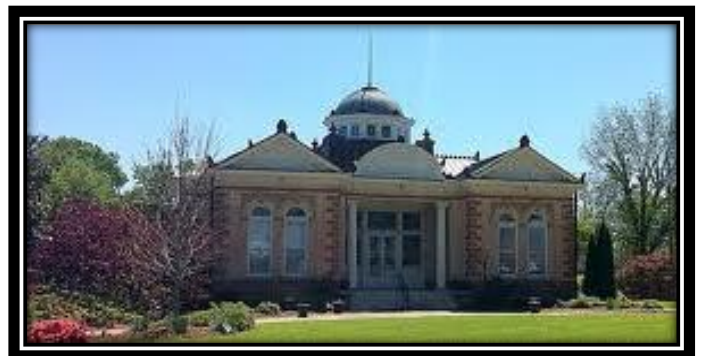
Union County Carnegie Library

As identified above, the Council's agency-wide assets exceeded liabilities at FYE 2013 by $8,102,250, an increase in net position of $1,709,103 over the FYE 2012 net position of $6,393,147. Of total net position, $1,117,247 (FYE 2013) and $1,068,707 (FYE 2012) are identified as unrestricted and not reserved for capital assets or other specified purposes. As the Council is restricted from incurring debt, this unrestricted portion of net position provides operating cash flow for the agency. The largest component of net position is restricted for the EDA Revolving Loan Fund. At FYE 2013, 84% of total net position, or $6,827,041, was associated with the EDA Revolving Loan Fund.