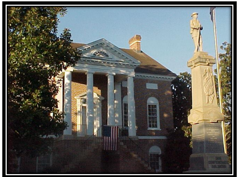
Historic Lancaster County Courthouse