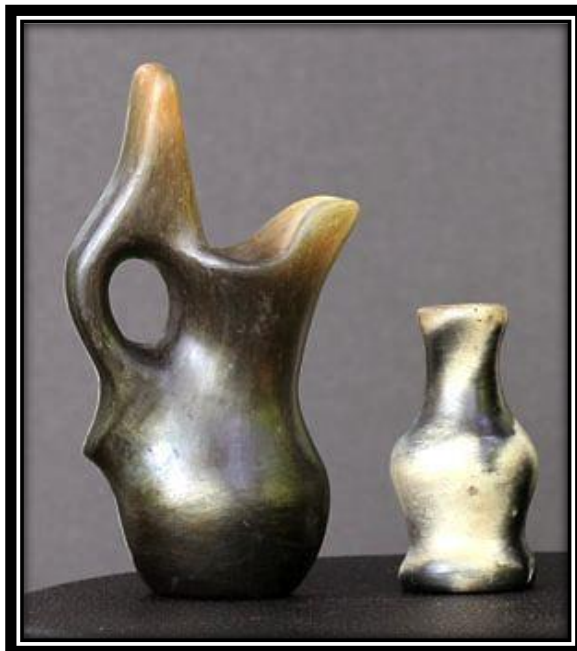
Catawba Nation Pottery