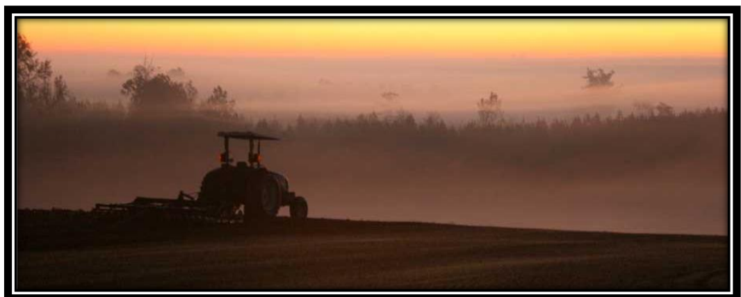
Farm in Jonesville, Union County