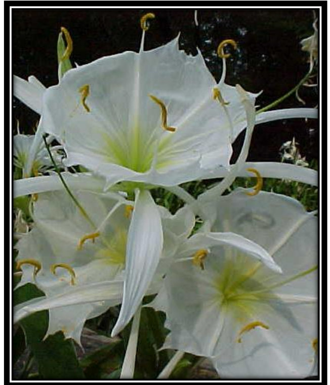
Rocky Shoals Spider Lilies – Landsford Canal