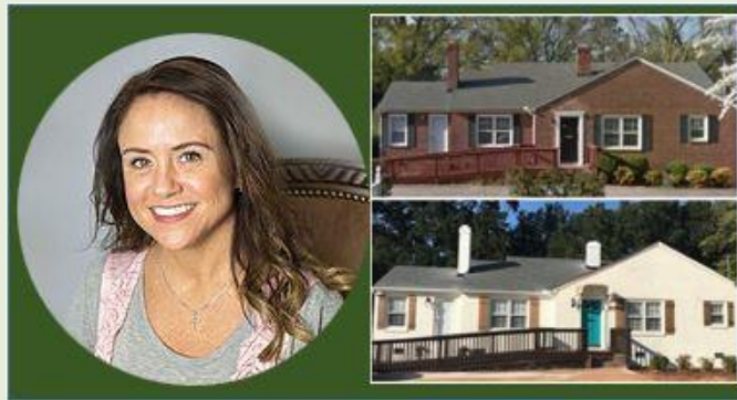
Above right: Business Property - Before and After

Milk & Sugar Spa and Salon 1156 Ebenezer Road Rock Hill, SC